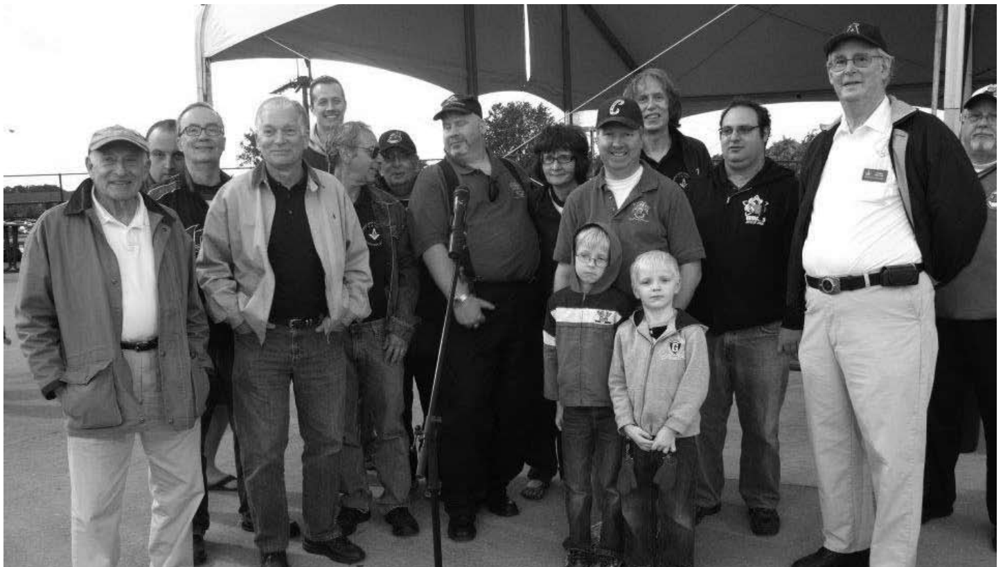
Forest City Lodge takes in a Lake County Captains Game.