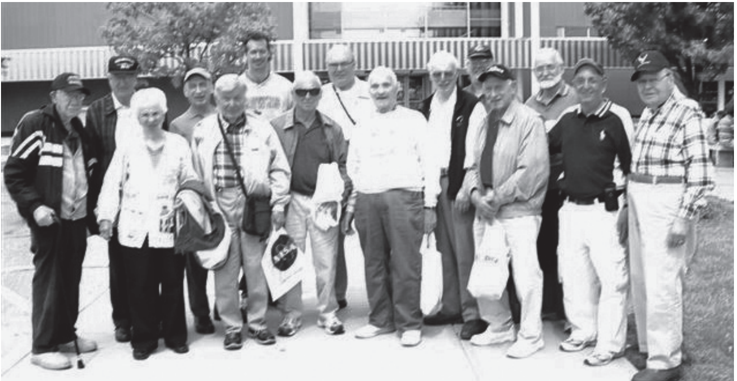
Several members of Forest City Lodge took a field trip to the National Museum of the USAF at Wright-Patterson Air Force Base in Dayton, Ohio. Everyone had a great time at the museum, as well as on the bus trip to and from. Thanks to everyone who joined us on the trip.